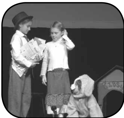
Scene from last year's "Henry and Ramona" School Show

Call to book a performance for your school group: (781) 648-6220