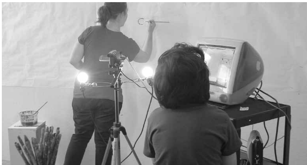
Teen Animation Class, Summer 2008

This class will explore drawing, printmaking and sculpture using every-day found objects (like that bike wheel you've been stashing in the basement for three years!). We'll get inspiration from well known artists who create collages and assemblages, turning discarded odds-and-ends into fine art fun. With Zach Pelham Saturdays, 2:00 – 4:00 pm $180 m, $195 nm