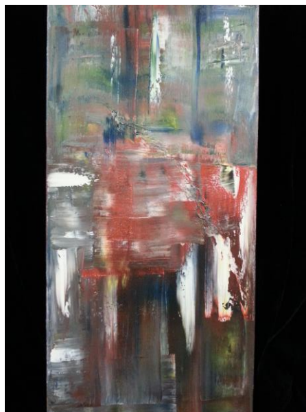
Transparent Reflection Oil on canvas 38"H x 16"W $400