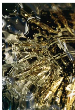
0039 Photograph on aluminum 24" x 16" $400