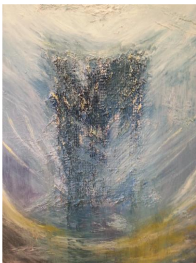
Passage Oil & mixed media on canvas 48"H x 36"W $850