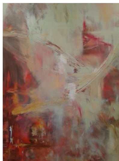
Splash Bravery Acrylic on Canvas 48"H x 36"W $850