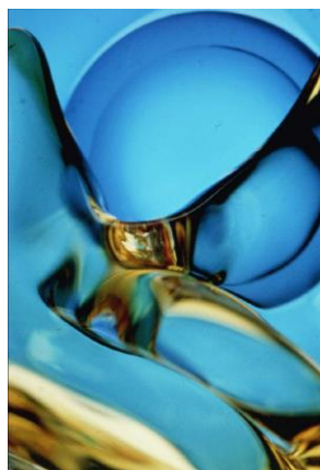
1706 Photograph on aluminum 24" x 16" $400